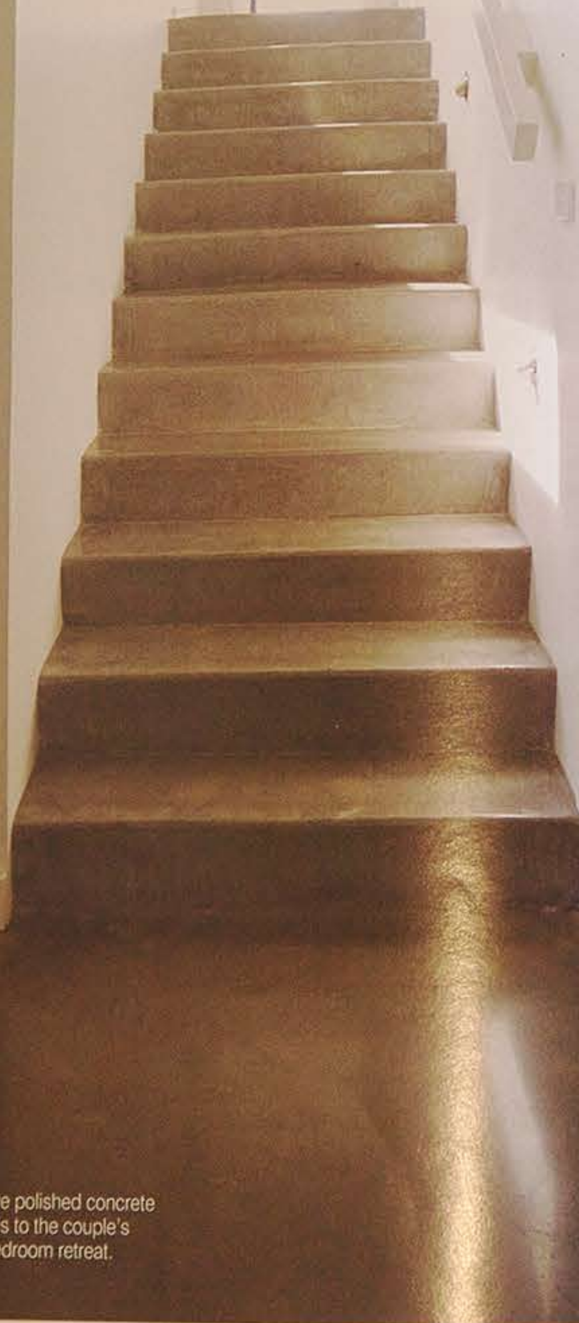
The impressive polished concrete staircase leads to the couple's upper level bedroom retreat.

This room has an ever-present view of the greenery of the reserve and a cleverly placed window means they can watch the sun rise from their pillows.