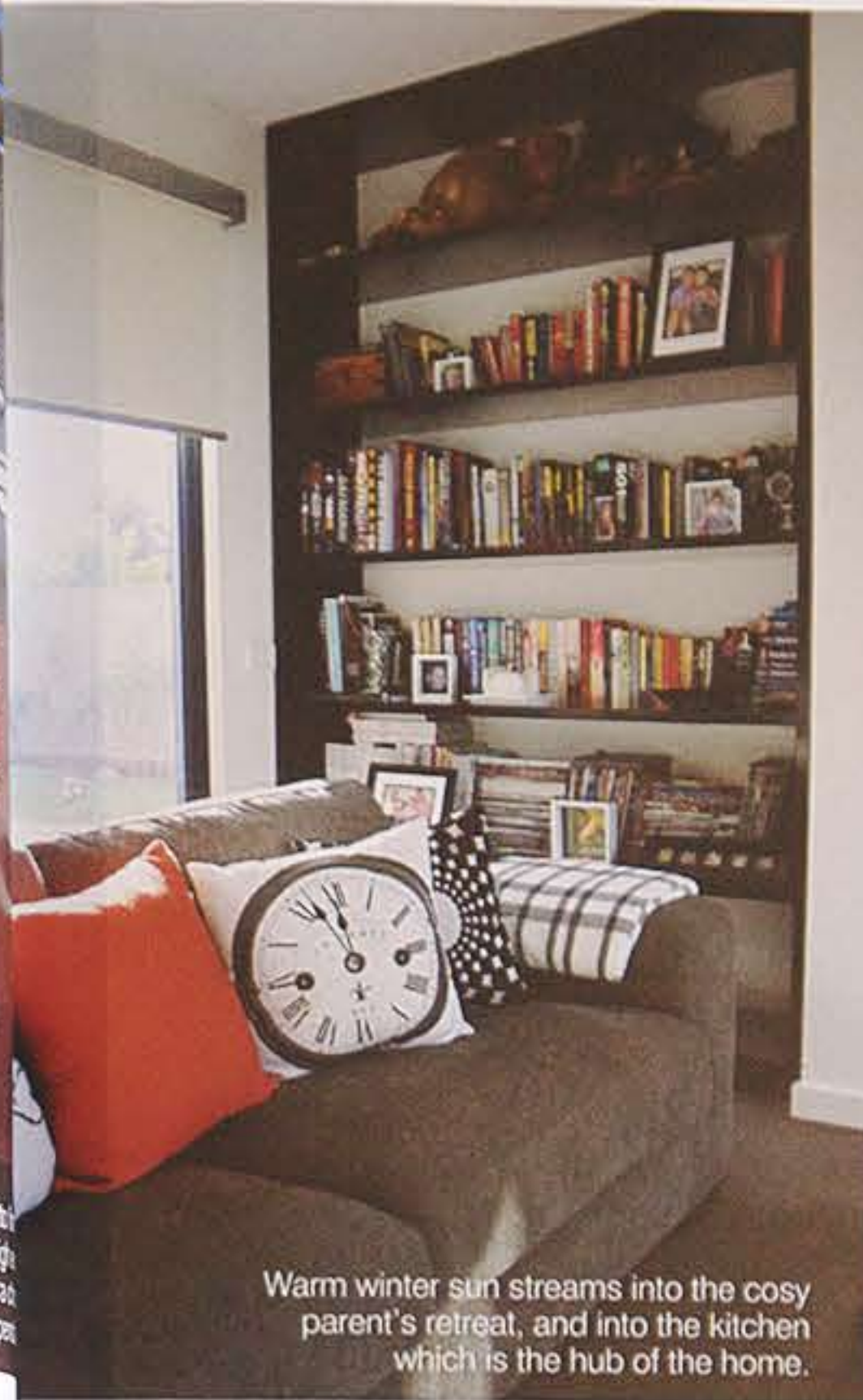
Warm winter sun streams into the cosy parent's retreat, and into the kitchen which is the hub of the home.