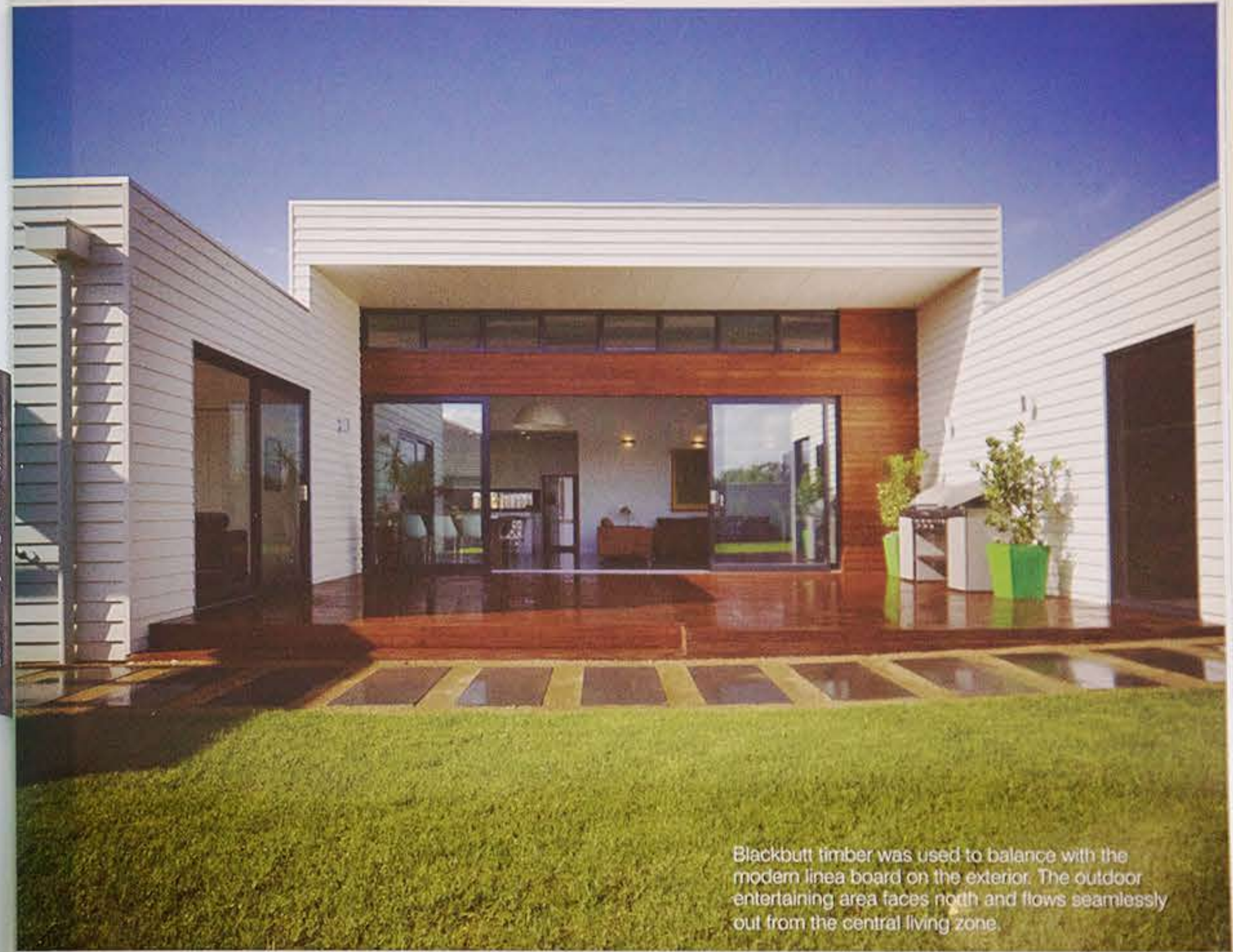
Blackbutt timber was used to balance with the modern linea board on the exterior. The outdoor entertaining area faces north and flows seamlessly out from the central living zone.

LONDON PICCADILLY CIRCUS PARK LANE LEXHAM GARDENS CHEZ PATRICK TADMOR STREET VIA P.PALLEY PORTOBELLO ROAD HUMMINGBIRD CAFE NOTTING HILL VIA MELT HYDE PARK MAYFAIR