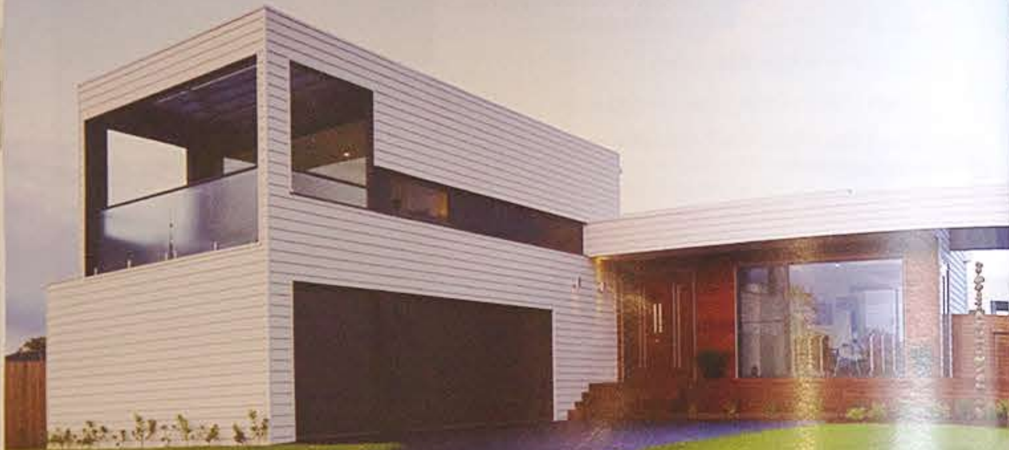
The striking home of the Addison's in Traralgon provides modern shapes on the horizon. OPPOSITE The green feature wall offers dramatic impact in the kitchen. Essa stone bench tops offer a sleek contemporary vibe.

This ar profess "compl Our te ongoin your p Our Sa